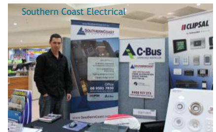
Southern Coast Electrical