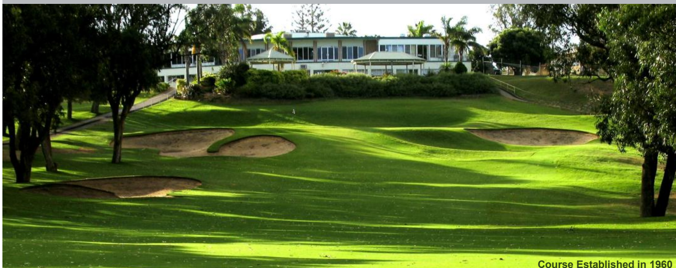
Course Established in 1960