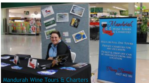
Mandurah Wine Tours & Charters