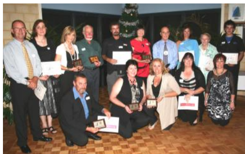
AWARD RECIPIENTS 2010

Nominations close on October 7 th . Call 9581 3693 or email: admin@peelcci.com.au for more information.