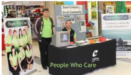
People Who Care

Thank you for your support, the feedback received has been very positive, some businesses confirming they would be taking up the opportunity in upcoming expos.